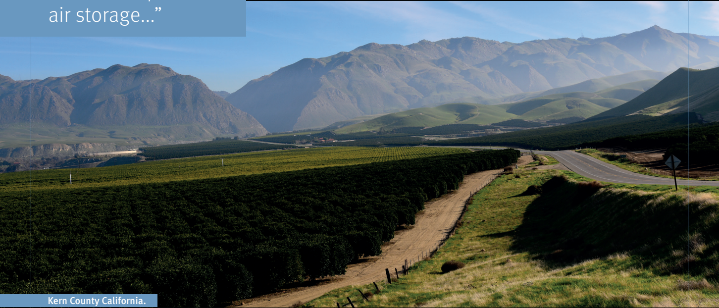
Kern County California.

“Another project planned for Kern County; California will use a rock cavern for the compressed air storage...”