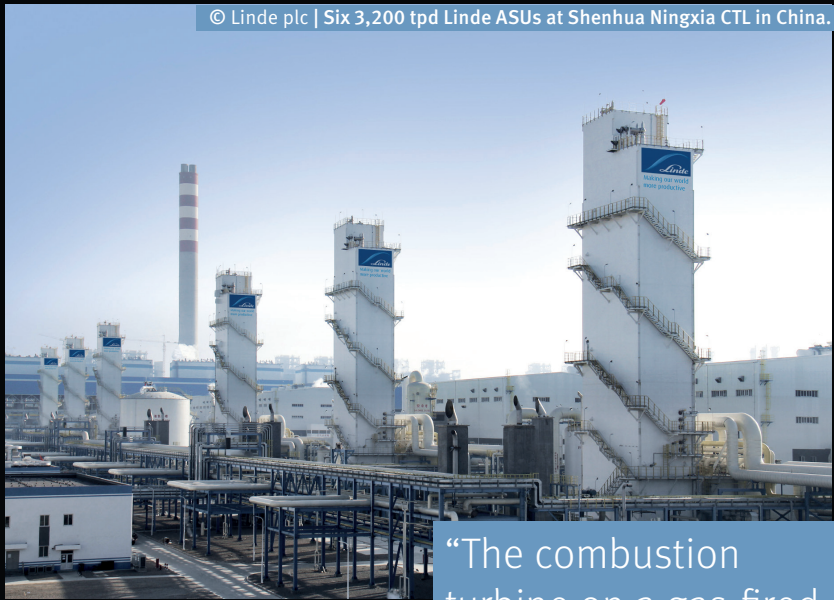
Six 3,200 tpd Linde ASUs at Shenhua Ningxia CTL in China.

The combustion turbine on a gas-fired power plant operates at a pressure of around 30 bar. About 65% of the energy produced by burning natural gas is used to compress the combustion air to the operating pressure. This issue seeded the idea of using stored compressed air to mix with natural gas to avoid the