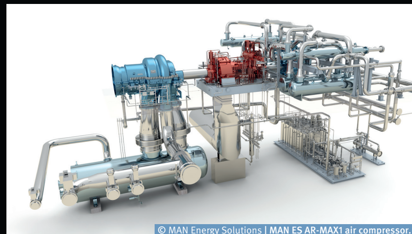
MAN ES AR-MAX1 air compressor.

The future of CAES lies in energy efficient power storage to support